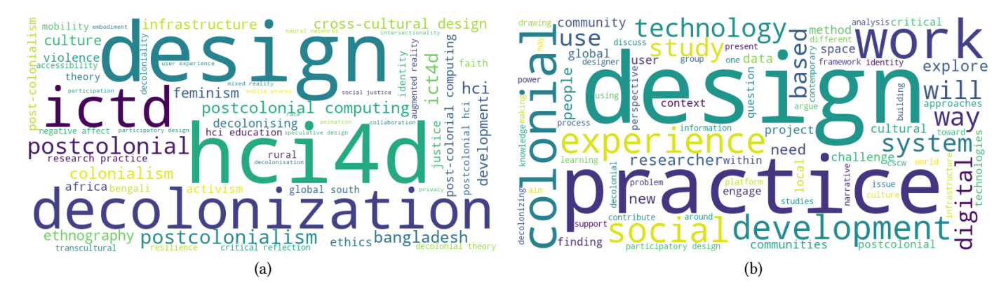
Figure 2: Word clouds based the papers' (a) keywords (b) abstracts.